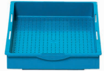
81711 Soaking unit