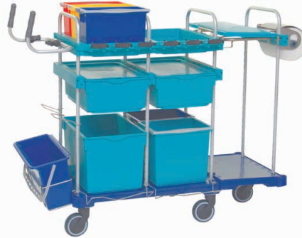
80770 SmartCar Competence WL2