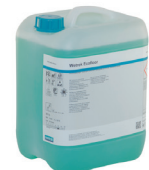
11620 Ecofloor 10 L container