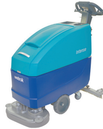
50334 Duomatic Intense 50 Dosing