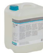
11000 Antiwax forte 10 L container